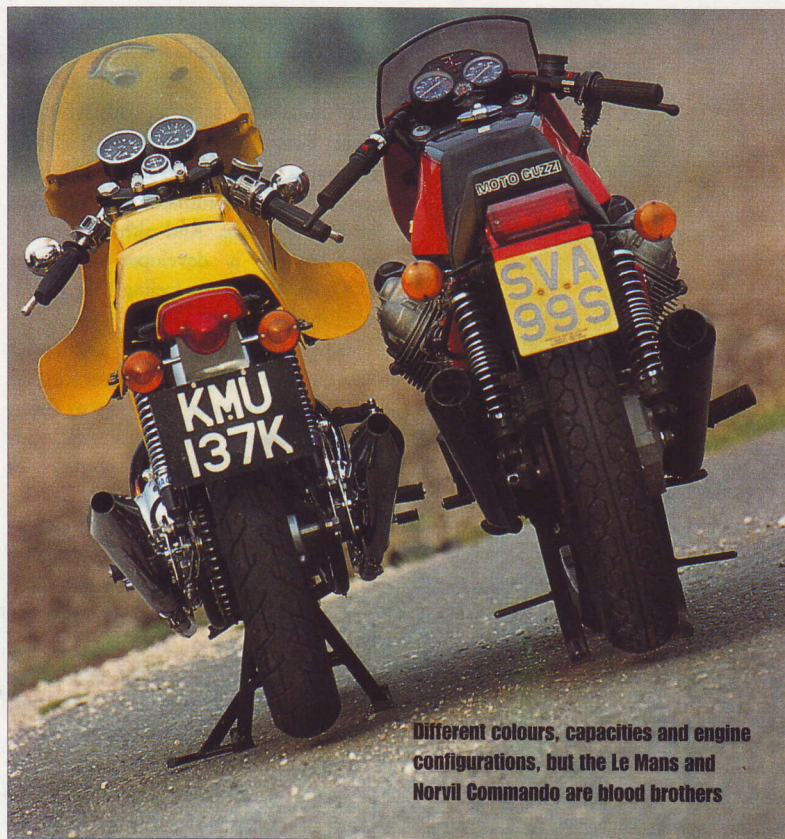
Different colours, capacities and engine configurations, but the Le Mans and Norvil Commando are blood brothers

ence to hold it balanced at walking pace on the rear brake, and crank over under power for a tight turn back up to Ray Archer's cameras.